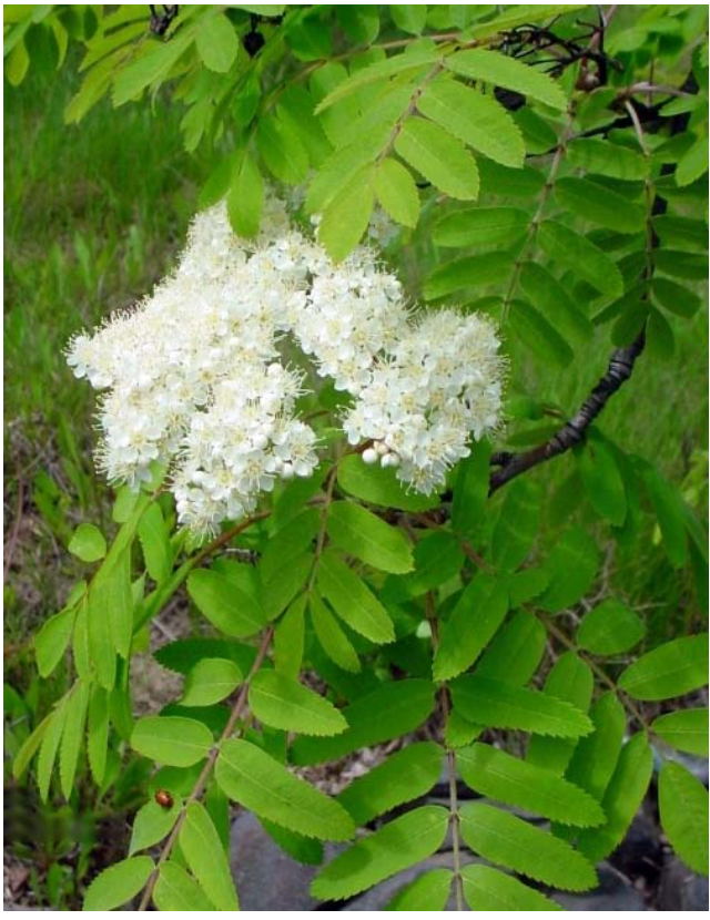
Flowers and foliage of Sorbus aucuparia L.

European mountain ash is an upright tree that grows from 7 \frac{1}{2} to 12 m tall with a rounded, open crown. Bark is gray or yellow-green and smooth. Leaves are alternate, pinnately compound, and 13 to 20 cm long with 11 to 15 leaflets per leaf. Leaflets are dark green above and pale green below. Flowers bloom in May and are borne in clusters that are 7 \frac{1}{2} to 13 cm across. They are small and white. Pomes (fruits) are bright orange, small, and persistent. They ripen in September (Welsh 1974).