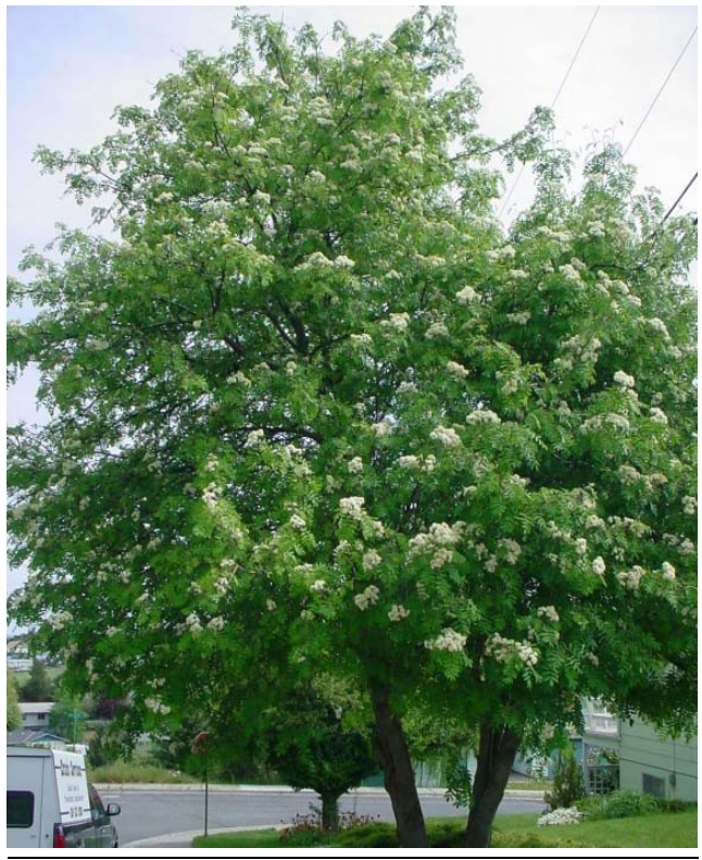
Sorbus aucuparia L.

Pacific Maritime coast, Cascade mountain ash grows throughout the southern half of Alaska, and Siberian mountain ash grows in the western Aleutian Islands. European mountain ash can be distinguished from all other native Sorbus species in Alaska because it is a tree (usually growing taller than 5 m), whereas all native Sorbus species are shrubs (usually growing shorter than 5 m). Additionally, European mountain ash can be distinguished from native Sorbus species by the presence of leaflets that are unequal and rounded at the base and fruits that are borne in clusters of more than 25.