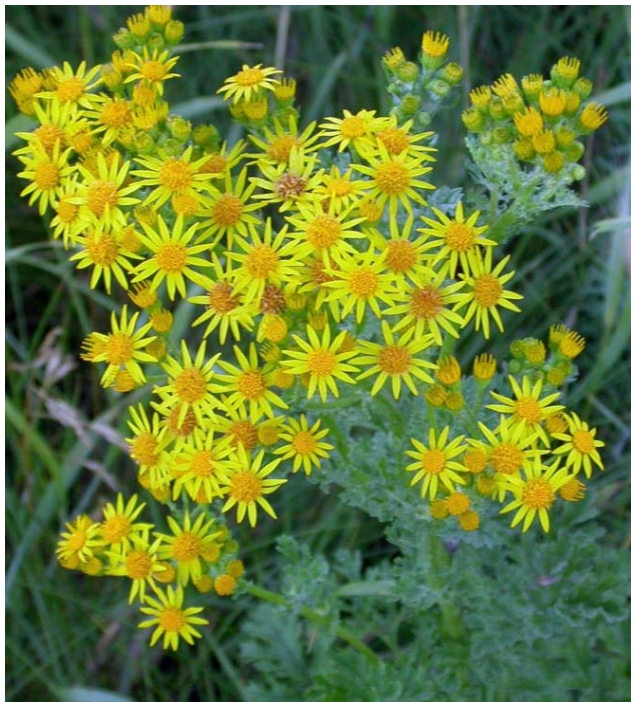
Flower heads of Senecio jacobaea L.

Tansy ragwort is a biennial or short-lived perennial herb that grows 30 ½ to 183 cm tall from a taproot. Stems are solitary or several and unbranched to the inflorescence. Young leaves and stems are sparsely and unevenly hairy. Leaves are 5 to 20 ¼ cm long, alternate, equally distributed, and two to three times pinnately lobed with the terminal lobes generally larger than the lateral lobes. Flower heads are arranged in terminal clusters of 20 to 60. They are small and are composed of yellow ray and disk flowers. Ray flowers are 10 to 13 in number and 6 to 12 ½ mm long. Seeds produced by disk flowers are minutely pubescent, bear two rows of pappus bristles, and retain their pappi; those produced by ray flowers are smooth and shed their reduced pappi early in development (Whitson et al. 2000). Ray flower seeds and disk flower seeds differ in their size, weight, dispersal mechanisms, germination requirements, and germination rates (Harper and Wood 1957).