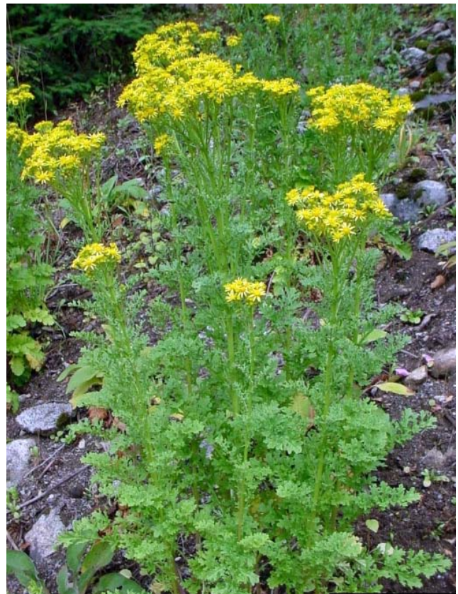
Senecio jacobaea L.

Similar species: Tansy ragwort can be distinguished from the other 17 Senecio species that grow in Alaska by the presence of leaves that are two to three times pinnatifid (rather than triangular, narrowly linear, or divided into linear segments). Many other Senecio species have a single, large flower head rather than numerous, small flower heads. Tansy ragwort can resemble common tansy ( Tanacetum vulgare ). Unlike common tansy, however, tansy ragwort has ray flowers and a pappus on each disk flower seed (Macdonald and Russo 1989, Royer and Dickinson 1999).