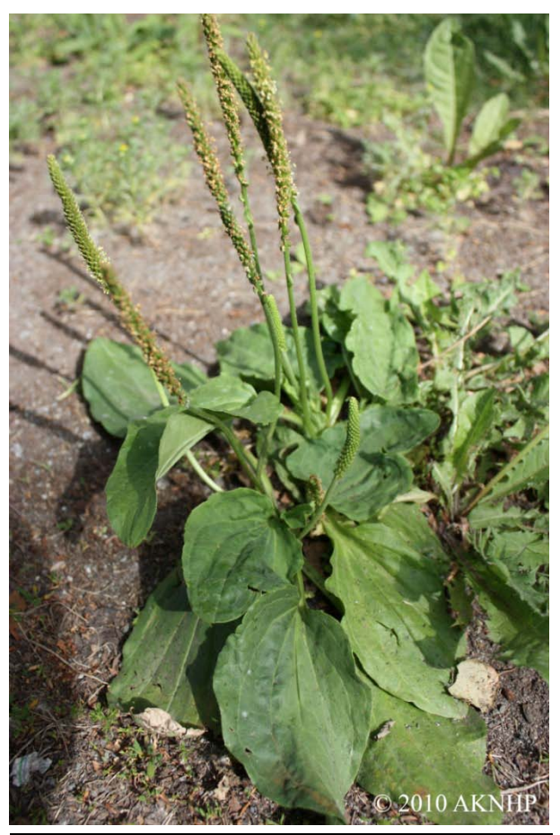
Plantago major L.

Impact on ecosystem processes: Common plantain is an early pioneer species, and it may alter successional regimes.