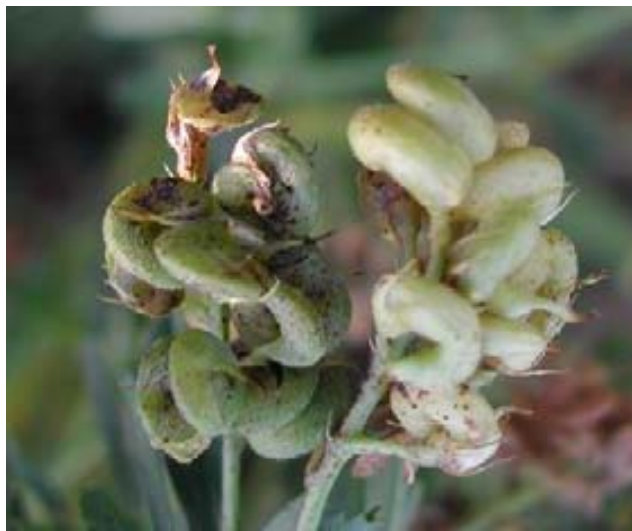
Fruits of Medicago sativa ssp. sativa L.

alfalfa can be distinguished from alfalfa because it has yellow flowers and straight or slightly curved, but not coiled, pods. Both alfalfa and yellow alfalfa can easily be confused with other weedy, trifoliate legumes, such as Melilotus and Trifolium species. Alfalfa can be distinguished from other trifoliate legumes, even when not in flower or fruit, by the presence of longer stalks on the central leaflets than on the lateral leaflets and toothed margins on the leaves.