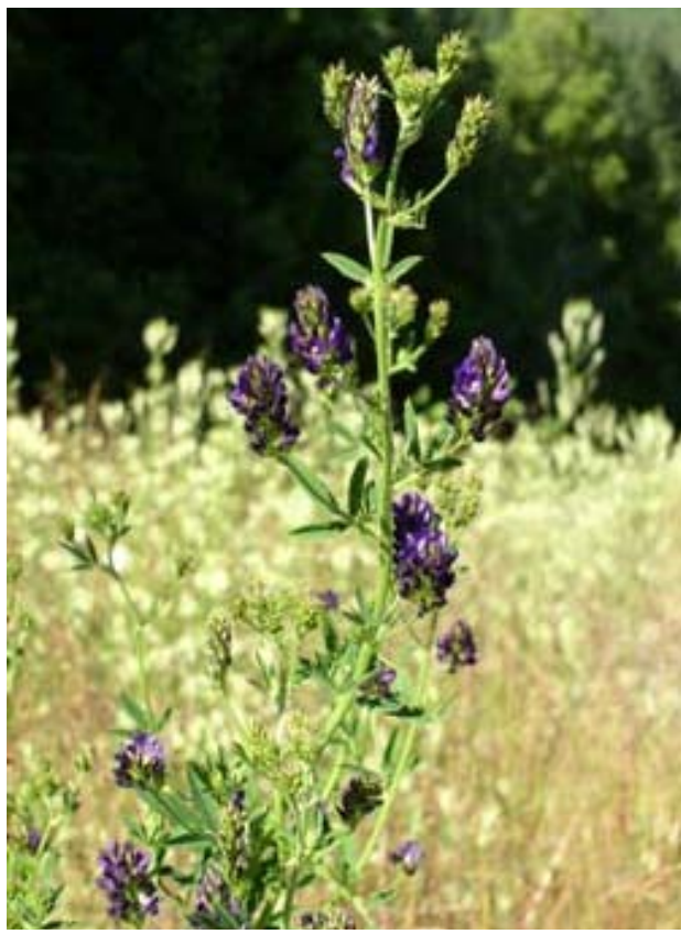
Medicago sativa ssp. sativa L.

Alfalfa is a perennial herb that grows up to 91 cm high. Multiple, erect stems grow from a thick, somewhat woody crown. Leaves are alternate and composed of 3 leaflets. Leaflets are ovate, hairy, and 13 to 38 mm long. Central leaflets are stalked, while lateral leaflets are sessile. Flowers are blue or purple and 13 mm long. They are arranged in oblong clusters in leaf axils. Fruits are spirally-coiled pods. Each fruit is 6 to 13 mm long and encloses several seeds (Hultén 1968, Hitchcock and Cronquist 1973, Royer and Dickinson 1999).