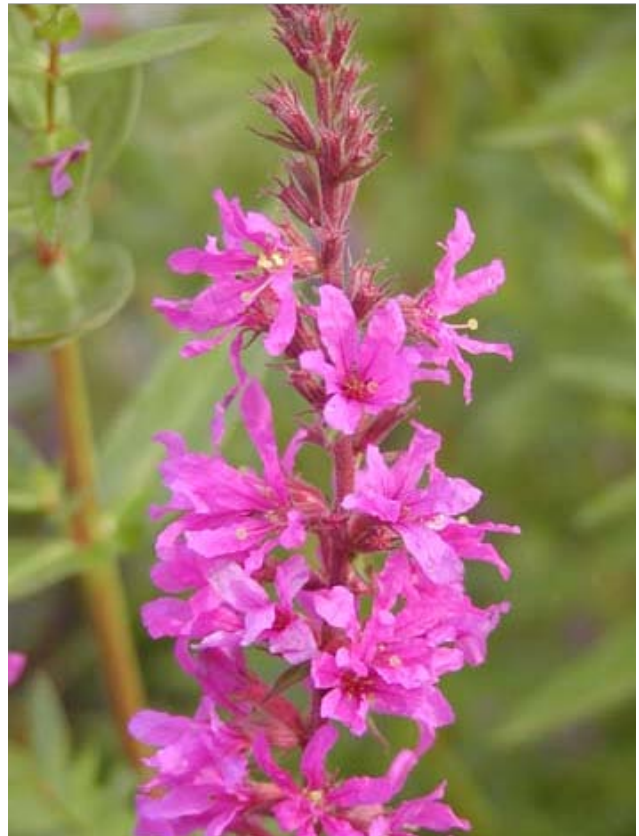
Inflorescence of Lythrum salicaria L.