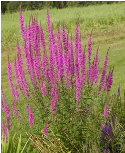
Lythrum salicaria L. in garden

Similar species: Purple loosestrife can be distinguished from the similar, native fireweed ( Chamerion angustifolium ) by its narrower, more slender spikes, four-edged stems, and opposite or whorled leaves.