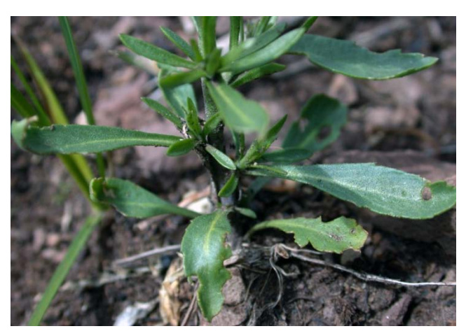
Foliage of Lepidium densiflorum Schrad.

Common pepperweed is an annual herb that grows up to 46 cm tall from a slender taproot. Stems are erect and branched above with fine, simple hairs. Basal leaves are arranged in rosettes. They are stalked, 2 ½ to 10 cm long, and usually toothed to deeply lobed. Stem leaves are alternate with smooth margins and no stalks. Flowers grow on elongate racemes. They are small and inconspicuous. Each flower is composed of four green sepals and lacks petals. Fruits are flattened, round to heart-shaped, small, up to 3 mm long, and slightly notched at the tip with papery margins. Each fruit contains two seeds (Douglas et al. 1998, Royer and Dickinson 1999).