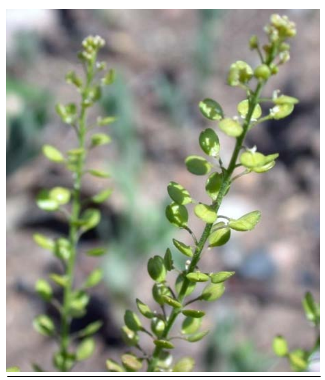
Fruits of Lepidium densiflorum Schrad. Photo by M. Harte.

Similar species: Gardencress pepperweed ( L. sativum ) can be distinguished from common pepperweed by the presence of narrowly dissected leaves, reddish-white petals, and fruits that are over 6 mm long (Douglas et al. 1998, Royer and Dickinson 1999).