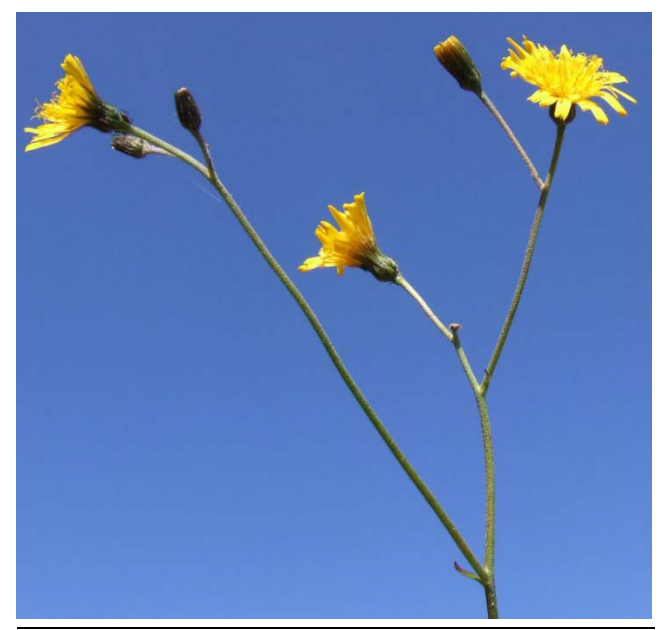
Flower heads of Hieracium lachenalii C. C. Gmelin.

Common hawkweed is a perennial plant that grows 20 to 80 cm tall. Plants exude milky juice when broken. Stems are hairy, erect, and usually solitary. Basal leaves are persistent, petiolated, lanceolate to elliptic, hairy or glabrous, 5 to 15 cm long, and 1 to 5 cm wide with toothed margins. Leaf bases are usually cuneate but are occasionally rounded or squared. Stem leaves are reduced in size up the stem. Flower heads are arranged in groups at the ends of stems. Peduncles are hairy. Florets are yellow, strap-shaped, and 13 to 18 mm long. Involucres are 8 to 11 mm tall. Involucral bracts are hairy and lanceolate with obtuse or acute tips. Seeds are cylindrical and 2.5 to 3.5 mm long. Each seed has a pappus composed of 30 to 40 bristles that are 4 to 5 mm long (Strother 2006, Klinkenberg 2010).