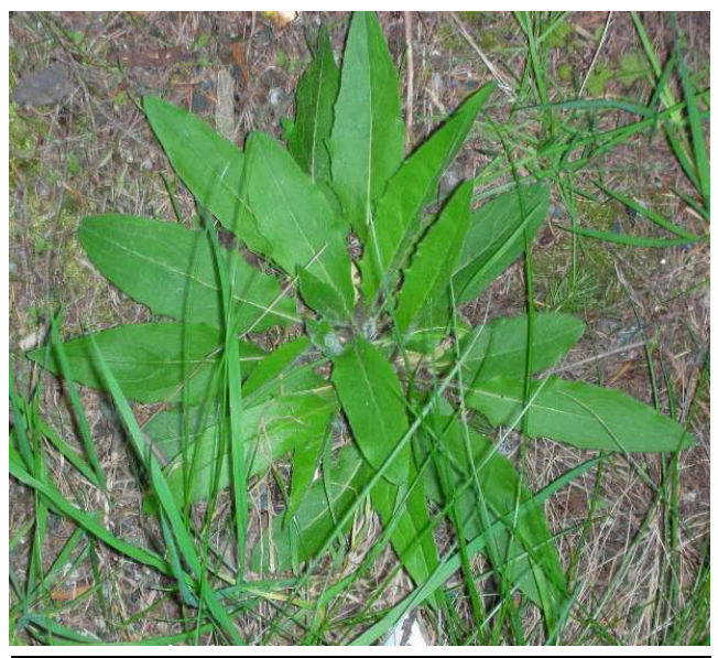
Basal rosette of Hieracium lachenalii C. C. Gmelin.

margins, leaves that are all basal or mostly basal, 40 to 80 florets per flower head, and cylindrical seeds that are 2.5 to 3.5 mm long. Several other yellow-flowered Asteraceae species that produce basal rosettes can be confused with common hawkweed. Common dandelion (including the native Taraxacum officinale ssp. ceratophorum and the non-native Taraxacum officinale spp. officinale) can be distinguished from common hawkweed by the absence of branched stalks and leaves on the stalks. Narrowleaf hawksbeard (Crepis tectorum) can be distinguished from common hawkweed by the presence of two rows of involucral bracts, involucres that are 6 to 9 mm long and 7 to 8 mm wide, and florets that are 10 to 13 mm long. Unlike common hawkweed, fall dandelion (Leontodon autumnalis) has deeply lobed leaves. Hairy cat's ear (Hypochaeris radicata) can be distinguished from common hawkweed by the presence of many scale-like bracts on the stems (Strother 2006, eFloras 2008, Klinkenberg 2010).