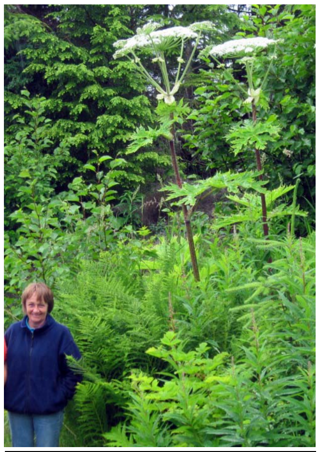
Infestation of Heracleum mantegazzianum Sommier & Levier around Kake, Alaska.

cow parsnip rarely exceeds 183 cm in height, has umbels that are 20 to 30 <sup>1</sup>/<sub>2</sub> cm in diameter, and has palmately lobed leaves (Hultén 1968).