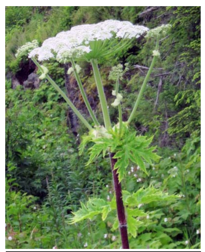
Umbel and foliage of Heracleum mantegazzianum Sommier & Levier.

Giant hogweed is a biennial or perennial plant that grows 3 to 4 ½ meters tall. Stems are hollow and 5 to 10 cm in diameter. They have dark reddish-purple spots and are covered in bristles. Leaves are large, compound, and 91 to 152 ½ cm in width. Inflorescences are manyflowered, broad, flat-topped umbels. They can grow as large as 76 ½ cm in diameter. Flowers are small and white to light pink. Fruits are flat, 9 ½ mm long, ovalshaped, and dry. Most plants die after flowering. Some flower for several years (Noxious Weed Control Program 2003).