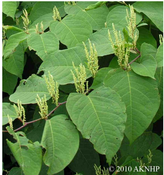
Inflorescences and foliage of Fallopia japonica (Houtt.) R. Decr.

Similar species: All native species of Polygonum in Alaska are considerably smaller and lack broad leaves. Giant knotweed has more heart-shaped leaf bases and less tapered leaf tips than Japanese knotweed (Zika and Jacobson 2003). Bohemian knotweed may also occur in Alaska. It is a hybrid between Japanese knotweed and giant knotweed.