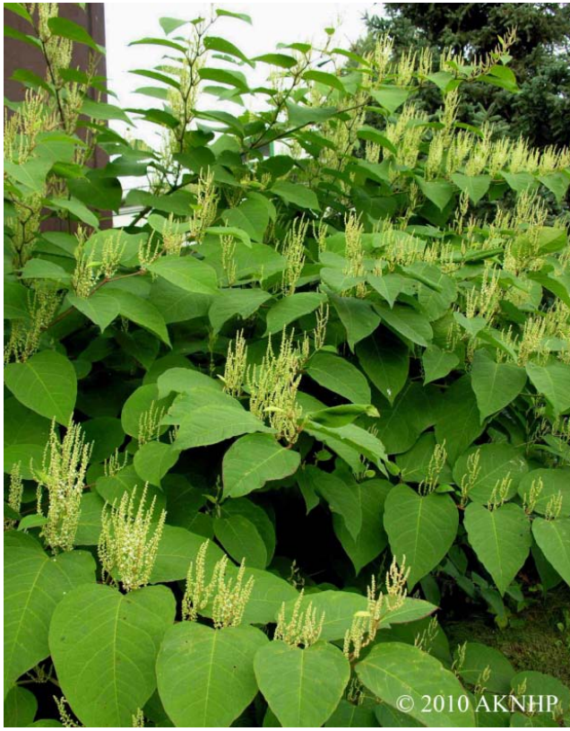
Infestation of Fallopia japonica (Houtt.) R. Decr.