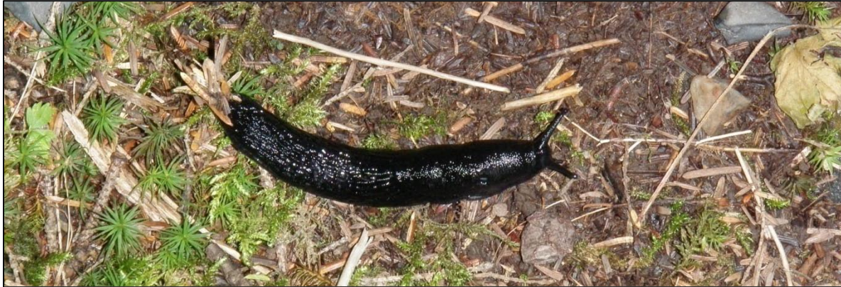
Figure 1. Adult black slug photographed near the community of Cordova, Alaska.

with the proximal portion larger and much wider than the distal portion (Royal British Columbia Museum 2002).