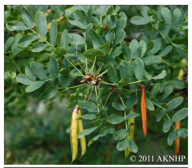
Fruits and foliage of Caragana arborescens Lam.

Similar species: Siberian peashrub is the only yellow-flowered, pinnately-leaved shrub in the pea family in Alaska. It is therefore unlikely to be confused with other species.