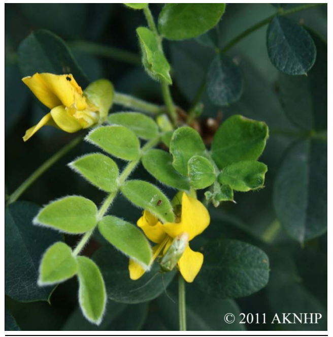
Flowers and young leaflets of Caragana arborescens Lam.

Siberian peashrub is a deciduous shrub or small tree that grows up to 4.5 meters tall. Plants usually have multiple stems arising from the root crowns. Stems have dark grey bark. Young branches have green to yellow-brown bark. Stipules are narrow, spine-like, and 5 to 10 mm long. Leaves are alternate or whorled and pinnately compound with 8 to 16 leaflets per leaf. Leaf axes, including petioles, are 3 to 10 cm long. Leaflets are obovate to elliptic, 10 to 25 mm long, and 5 to 15 mm wide with entire margins and short points at the tips. Young leaflets are short, silky, and hairy. Older leaflets are nearly hairless. Flowers are borne singly or in small groups. Peduncles are 12 to 35 mm long. Pedicels are 5 to 15 mm long. Calyxes are bell-shaped and 4.5 to 8 mm long. Corollas are yellow and 16 to 23 mm long. Pods are linear-lanceolate, green, strongly flattened, sessile, and 3.5 to 6 cm long. At maturity, pods become more cylindrical and brownish until they open forcefully (Welsh 1974, eFloras 2008, Klinkenberg 2010).