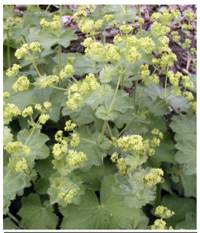
Inflorescences and foliage of Alchemilla mollis (Buser) Rothm.

Hairy lady's mantle looks similar to lady's mantle but differs by the following features. Stems are up to 50 cm tall. Teeth on the leaf margins are more pointed. The space between basal lobes on either side of the petiole is narrow or closed. Upper inflorescence branches and pedicels are glabrous. Hips are glabrous to sparsely hairy (Stace et al. 2005, Bojňanský and Fargašová 2007).