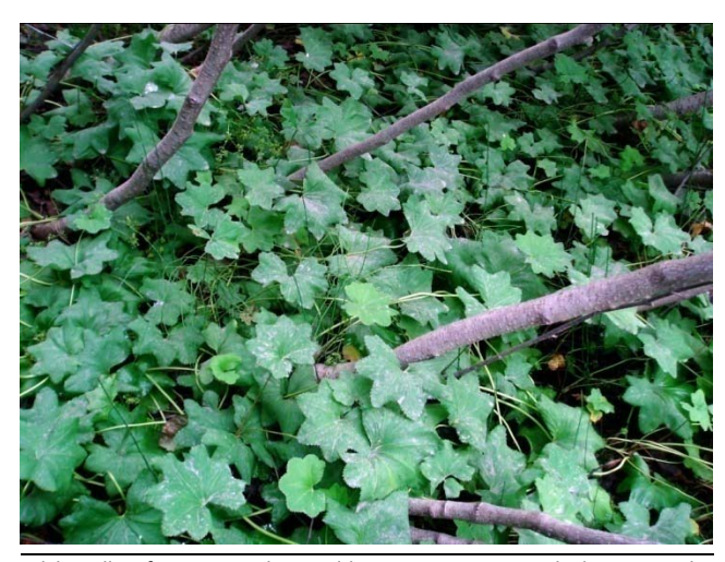
{\it Alchemilla} infestation under an alder canopy near a roadside in Hoonah, AK.

Similar species: No other species in Alaska can be easily confused with lady's mantle or hairy lady's mantle.