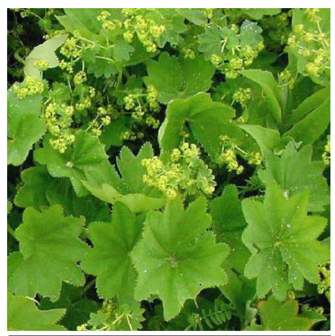
Inflorescences and foliage of Alchemilla monticola Opiz.

Similar species: No other species in Alaska can be easily confused with lady's mantle or hairy lady's mantle.