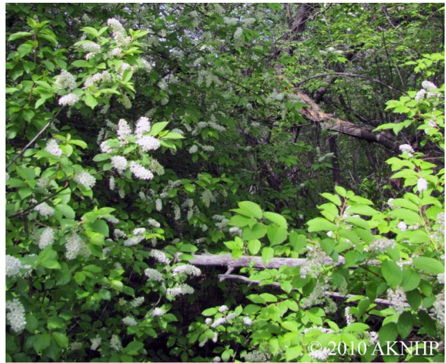
Infestation of Prunus padus L. along a trail in Anchorage, Alaska.

Impact on ecosystem processes: European bird cherry likely reduces light, moisture, and nutrient availability for other species (J. Conn – pers. com.). Little is known about the impact of European bird cherry on ecosystem processes.