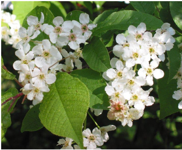
Foliage and flowers of Prunus padus L.

European bird cherry is a shrub or small tree that can grow up to 9 meters tall. Bark is purple-gray to green-gray. Leaves are long-petiolated, up to 10 cm long, elliptic to obovate, and sharply serrate. Numerous, showy flowers are arranged in elongate, cylindrical, terminal racemes. Petals are white or cream-colored and usually 4 to 6 mm long. Fruits are black and ovoid (Welsh 1974).