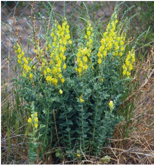
Linaria dalmatica L.

Dalmatian toadflax is a perennial plant that grows up to 91 cm tall from a stout, woody rootstalk. Stems are glabrous, erect, and often branched. Leaves are 19 to 25 ½ mm wide, lanceolate to ovate, acute or long-tapered, clasping, and alternate (although they often appear to be opposite). Stems and leaves are smooth and bluish-green. Flowers are born in long terminal inflorescences. They are two-lipped and 19 to 38 mm long. Each has a long spur. The throat, which closes the lower lip, is densely hairy and white to orange colored. The fruits are two-celled capsules. Each capsule contains numerous small seeds (Wetherwax 1993, Royer and Dickinson 1999, Whitson et al. 2000).