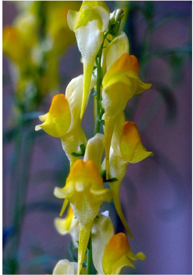
Flowers of Linaria dalmatica L.