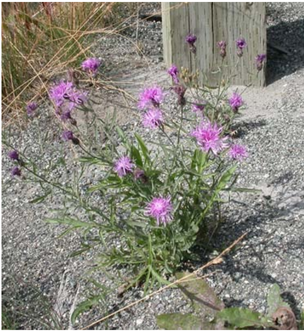
Centaurea stoebe L.

Spotted knapweed is a biennial to short-lived perennial plant. Stems are 30½ to 91 cm tall and generally branched. Rosette leaves are compound with several irregularly lobed segments. Stem leaves are alternate, 5 to 15 cm long, more or less hairy, and resin-dotted. Lower stem leaves are narrowly divided, while the upper stem leaves are undivided. Flower heads are 19 to 25½ mm wide and are composed of purple disc florets (Royer and Dickinson 1999, Whitson et al. 2000).