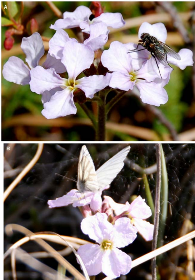
Figure 2. Floral visitors. 2A. Muscid fly and 2B. Pieris angelika visiting Parrya nudicaulis . doi:10.1371/journal.pone.0032790.g002

Due to low pollinator abundance and the unreliability of pollinator services in an unfavorable and stochastic climate, plants that rely on pollinator services are considered to be extremely rare in arctic and alpine habitats. Indeed, our data indicates low visitation rates in both years and high variation in pollinator activity among years possibly due to differences in climate between the years. This pattern has been observed in other alpine tundra studies that correlate lower pollinator visits with reduced seed set [11,14]. While data on visitation rates of arctic and subarctic alpine plants are not widely published, the mean visitation rate during periods of favorable weather ( >10^\circ\text{C} , light winds and not raining) for Parrya nudicaulis was 0.582 VFH in 2009 and 0.14 VFH in 2010. Visitation rates of P. nudicaulis correspond well to other alpine plant pollinator studies, but appear to be substantially lower compared to lower elevations and lower latitudes. Pollinator visitation rates in high elevation sites in Chile were 0.19 VFH [67]. The mean visitation rate of seven alpine species in Norway was 0.52 VFH in a favorable climate year [13]. Compared to other interior Alaskan plant species, syrphid fly visitation rates of 1.9 VFH was observed for flowers of Saxifraga reflexa in lowland bluff habitats [68]. Studies in temperate habitats generally range from approximately 1.8–3.5 VFH (for example [69–72]). Additional